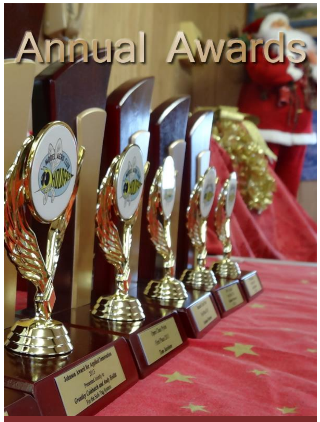
Just some of the trophies awarded to HMAC members at the Christmas BBQ and Trophy Presentation day held on December 1st. More details of award recipients can be found on page 4

Even if you don't participate, come as a spectator and enjoy the events.